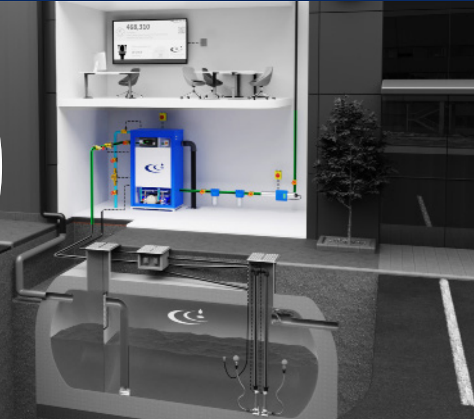
*Colour highlights extent of Stormsaver works